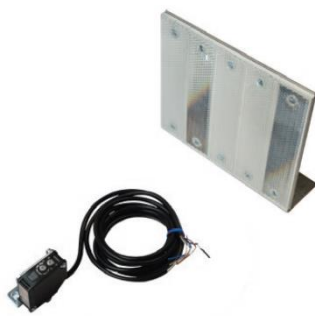
Single Event LED