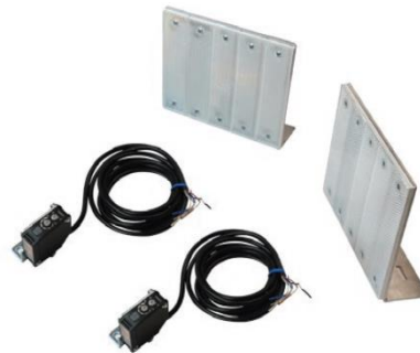
Single Event Twin LED