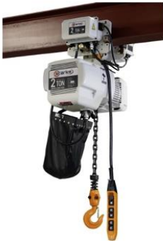
Hoists & Trolleys

Contact Your Starke Representative for More Information on Products to Help Maximize Your Workplace Efficiency