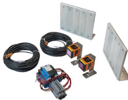
Dual Event Twin LASER