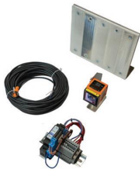
Dual Event Single LASER